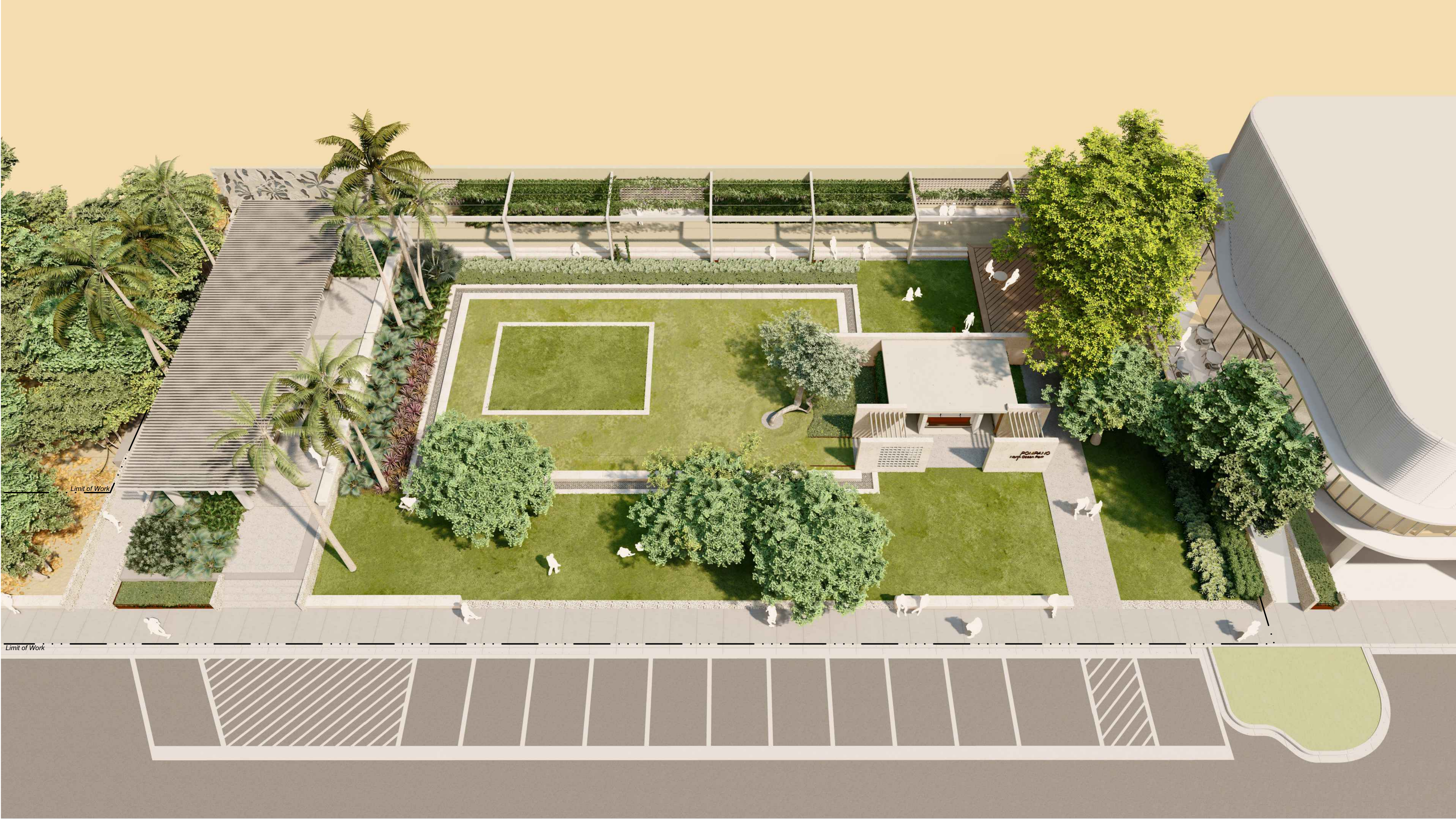
1 PARK 3D OVERVIEW L-102 NTS

NOTE: FOR ILLUSTRATIVE PURPOSES ONLY. REFER TO SITE PLAN FOR FURTHER INFORMATION.